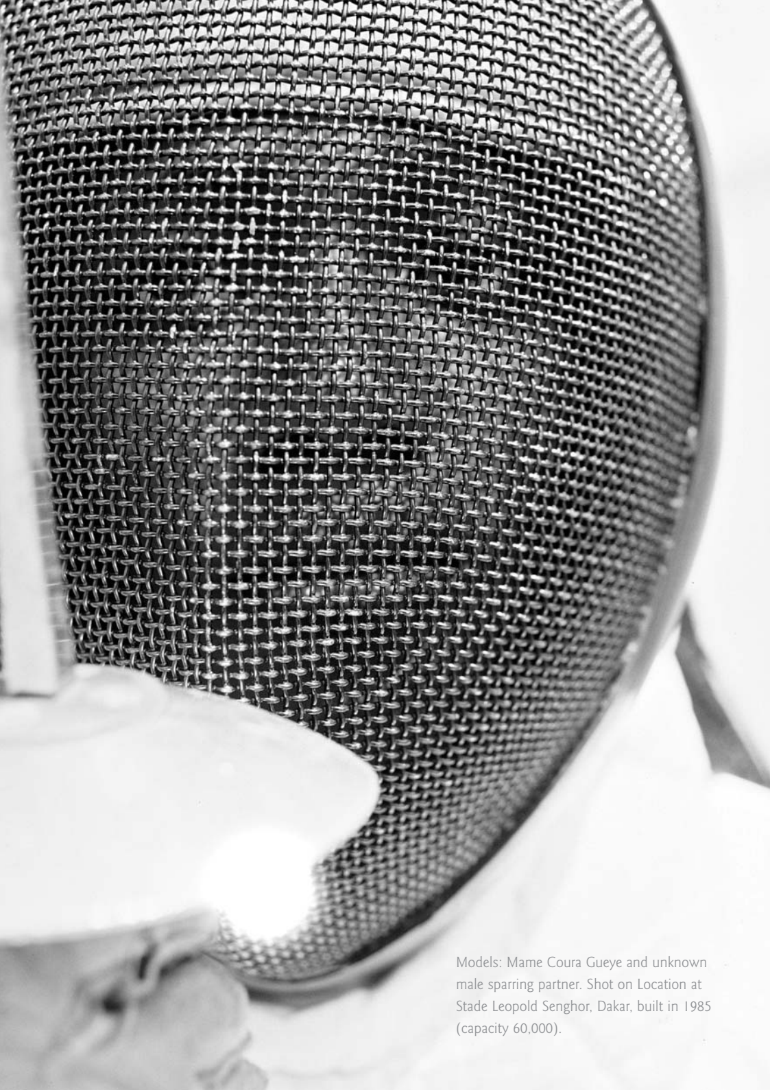
Models: Mame Coura Gueye and unknown male sparring partner. Shot on Location at Stade Leopold Senghor, Dakar, built in 1985 (capacity 60,000).